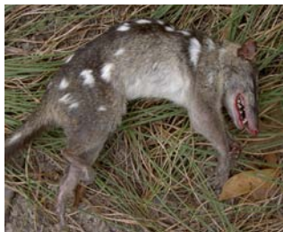
Locally extinct: The northern quoll