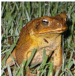
Adult Cane Toad

An aggressive predator, the cane toad competes with a multitude of small native species for a limited food supply. They also produce a highly toxic poison which makes them a deadly meal for native and domestic animals alike.