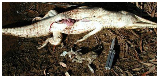
Freshwater crocodiles and numerous snake species have little chance against the toad