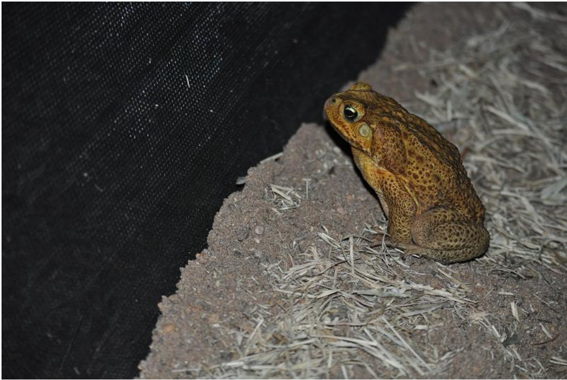
An adult cane toad is blocked by one of STTF's exclusion fences.

The Foundation secured $204,000 of Federal Government funding through their Caring for our Country grants scheme in late 2009. Some of this funding was used in the 2009-10 financial year to prepare for The Great Toad Muster 2010. The remainder will be used in the next financial year.