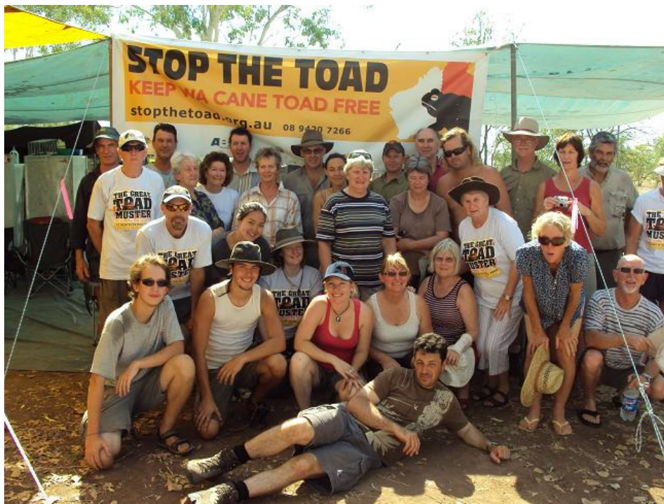
Volunteers on the 2009 Great Toad Muster.