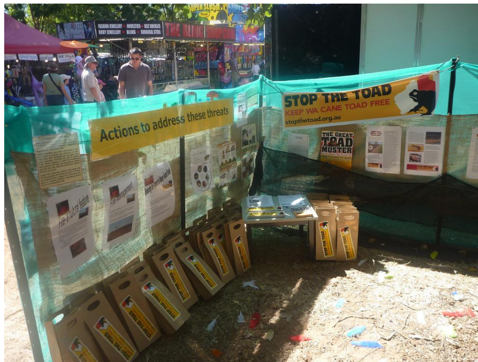
Promoting community awareness at the Kununurra Agricultural show.

Stop The Toad Foundation (Inc) Rules of Association – Clause 3