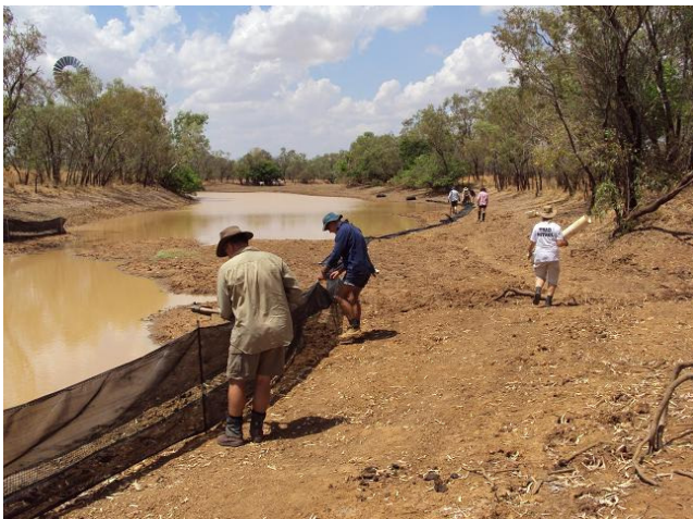
Volunteers erect an exclusion fence on Auvergne cattle station during the 2009 Muster.

The fencing strategy has a significant potential to be used across northern Australia as a tool for cane toad control as the fences are cost effective, easy to erect, wildlife friendly and can guarantee to remove all toads in a specific area. They could be used to protect areas of high biodiversity and National Parks. The fences also have broader application to protect property within towns and to restrict the potential of 'hitch-hiker toads' to reach more sensitive environments from transport and trucking facilities.