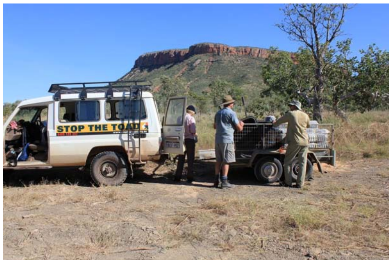
Volunteers on the Emma gorge fence project

The Keep Emma Gorge Cane Toad Free Project is an exciting project. It has huge potential that if successful may set an example for other areas in Australia to follow. The total cost - $7144- is not that much to invest to keep toads out of one of the most iconic gorges in The Kimberley. A biological or genetic solution to cane toads may still be 10-20 years away. Until that time, this project represents a pro-active solution to keeping unique wildlife areas cane toad free.