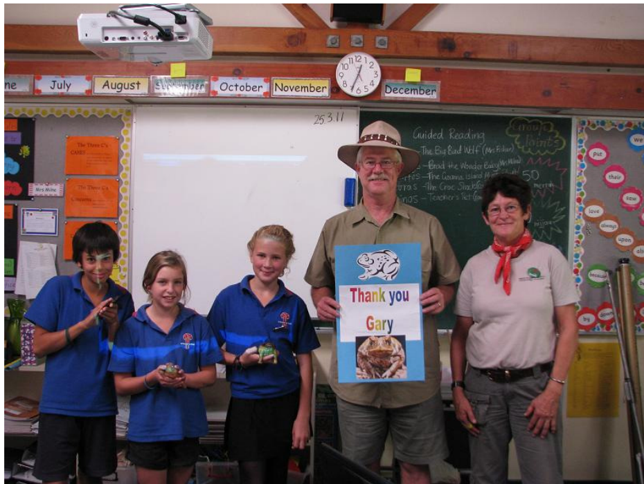
STTF Volunteers educating Pemberton District High School on cane toads.