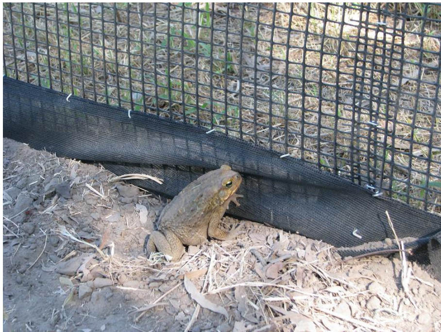
An adult cane toad is blocked by one of STTF's exclusion fences.

This report covers the period from 1 July 2010 to the end of its sixth financial year, 30 June 2011.