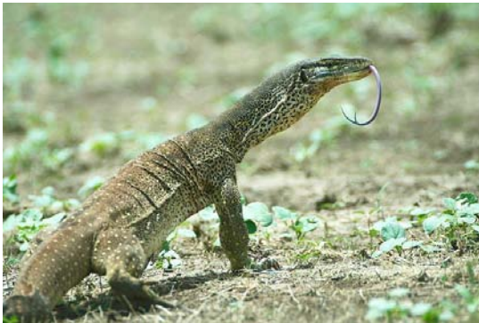
A Yellow-spotted Monitor (Varanus Panoptes); one of the native goanna species impacted by cane toads.