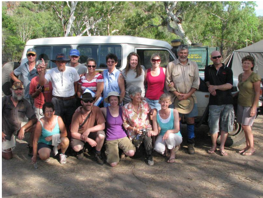
Volunteers on the 2010 Great Toad Muster.