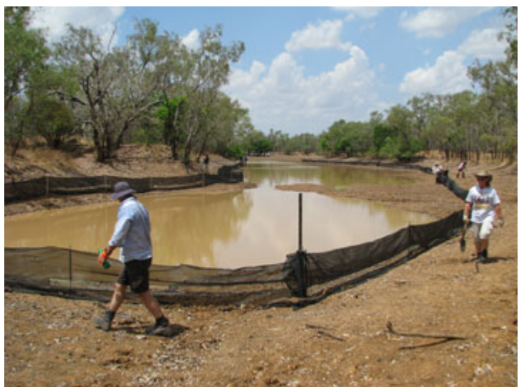
Volunteers erect an exclusion fence on Auvergne cattle station.

The fencing strategy has a significant potential to be used across northern Australia as a tool for cane toad control as the fences are cost effective, easy to erect, wildlife friendly and can guarantee to remove all toads in a specific area. They could be used to protect areas of high biodiversity and in World Heritage Listed sites, such as Purnululu National Park in Western Australia. The fences also have broader application to protect property within towns and to restrict the potential of 'hitch-hiker toads' to reach more sensitive environments from transport and trucking facilities.