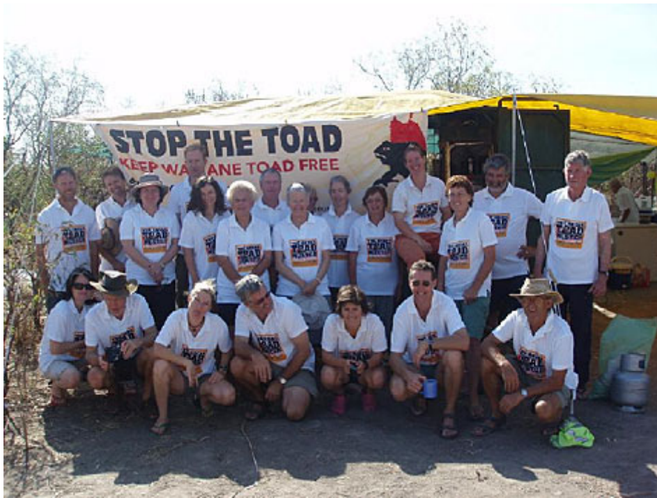
Volunteers on the 2008 Great Toad Muster