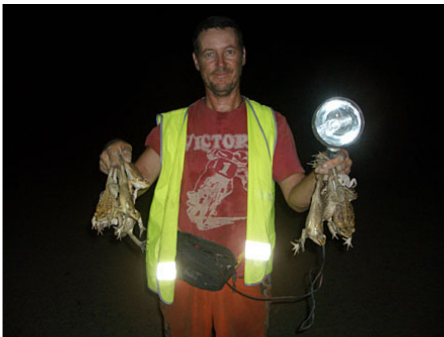
A volunteer collects toads on the Great Toad Muster 2008.

Stop The Toad Foundation (Inc) Rules of Association – Clause 3