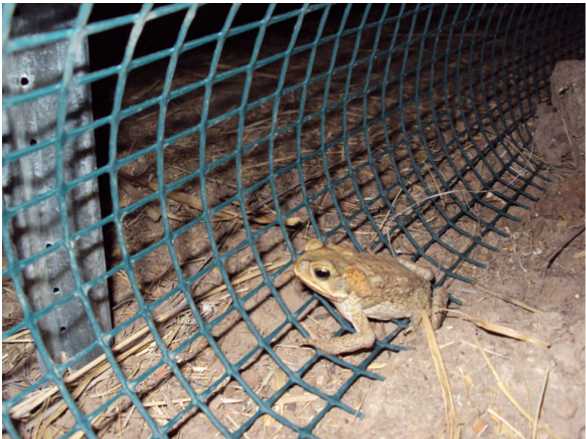
An adult cane toad is blocked from water by a wildlife gate on STTF's exclusion fences.

The Foundation secured $150,000 of Federal Government funding through their Caring for our Country grants scheme in late 2008. Some of this funding was used in the first half of 2009 to prepare for The Great Toad Muster 2009. The remainder will be used in the next financial year.