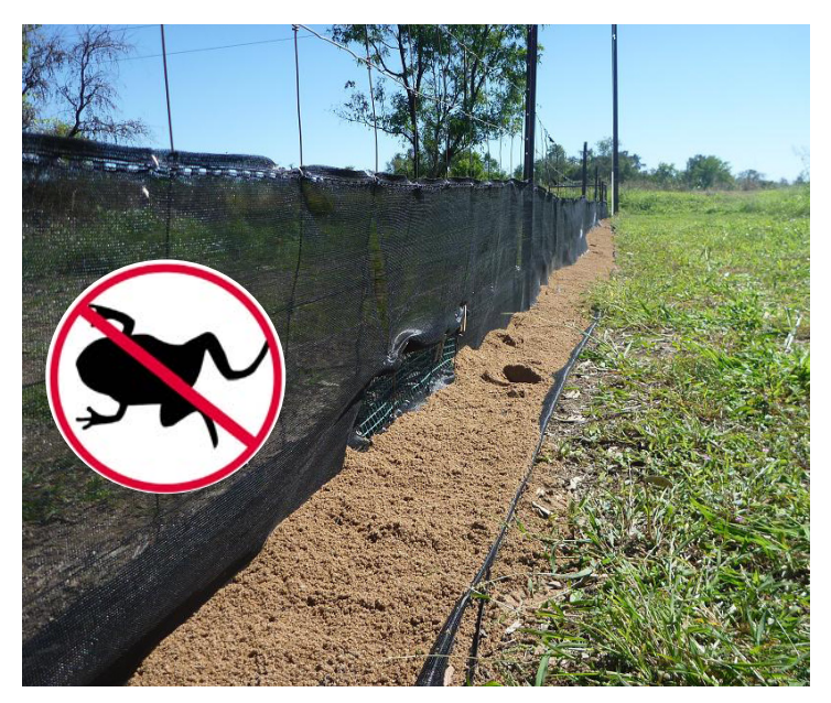
Cane toad proof fence

If you already have a fence surrounding your property, it is easy to make it toad proof to protect your pets and native wildlife. Smaller fences can also be used within your property to keep toads out of specific areas such as swimming pools and BBQ areas.